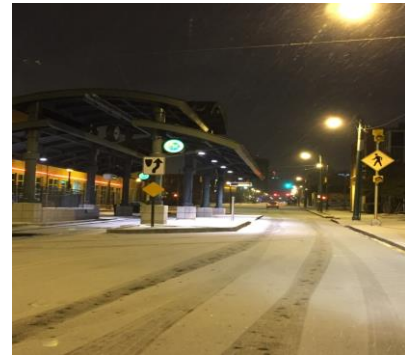
Captions: Left: Fog January 2. Center: Flash flooding, McLean Blvd January 11. Right: Snow, North Main January 6.

National Weather Service 7 Day Hazardous Weather Outlook: The probability for widespread hazards is LOW. Spotter activation is not anticipated. Visit www.weather.gov for information.