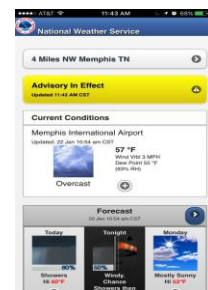
NWS Mobile Weather