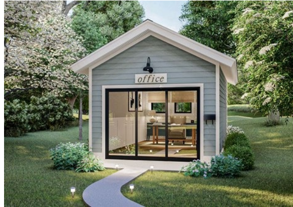
Example big windows and general style.