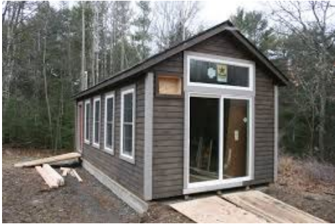
Example windows and general style