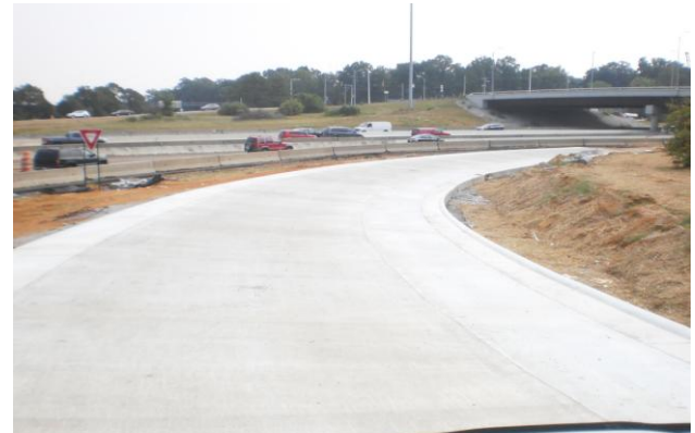
-Permanent ramp 17D from Walnut Grove Rd. WB to I-240 WB

Please visit http://www.tn.gov/tdot/projects/west.htm for additional project information.