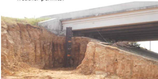
-Pile driving at bridge abutments

Retaining wall construction will be nearing completion. Drainage installation will progress in conjunction with construction of sub-base on the WB side. Asphalt paving operations will suspend temporarily until spring. Installation of light standard will remain active through the project along with construction of outer barrier wall when weather permits.