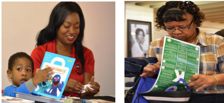
Left: A youngster at the Holy City Expo shows off his Sesame Street preparedness book, Right: A visitor picks up HELP / OK signs

On October 10, the Shelby County Office of Preparedness was excited to meet the public and hand out preparedness literature at the Eighth Annual Holy City Health and Wellness Expo at 3174 James Road. Over 200 citizens participated in this fun community event.