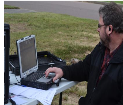
Photo Captions: Left: Setting up antennas, Middle: Shelby County Mobile Emergency Operations Center, Right: Receiving incoming email messages from the Tennessee Emergency Management Agency

On October 2 and 3, the Shelby County Office of Preparedness was the primary site for an AuxComm exercise to test auxiliary communications during a catastrophic disaster. The exercises supposes that a 6.5 magnitude earthquake strikes along the New Madrid Seismic Zone killing 3,000, injuring 35,500, with thousands displaced needing short term shelter. Communications were affected, bridges and roadways were impassible, HAZMAT incidents occurred, and shortages of essential supplies, such as food, water, and fuel, were reported.