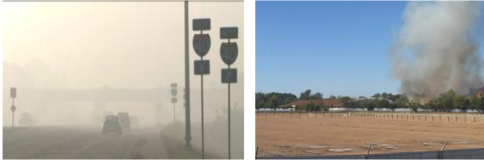
Photo Captions: Left: Smoke on I-240, Right: Smoke from the fire on Macon Road

On October 13, a fire ignited at Jones Mulch and Wood Recycling Plant in Northeast Memphis bellowing black, thick smoke into the air, and reigniting October 16. It did not pose a threat to businesses, but the smoke created a health hazard. The Shelby County Health Department issued a “Code Red” and then a “Code Orange” alert. The elderly and those with respiratory problems, such as asthma or allergies, were urged to stay inside. On October 15, the Shelby County Fire Marshall issued a “burn ban” after a long period of low humidity and little rain. The ban is on all open burning in the response areas of unincorporated Shelby County.