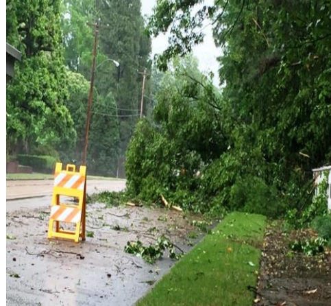
Captions: Left: Ponding water covers the left lane on Humphreys Blvd April 30 Right: Down trees on Walnut Grove on April 30 blocking right lane